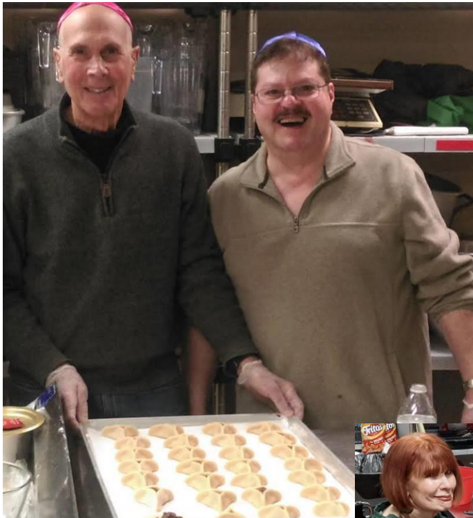
Just a few of the 2020 Hamentashen Crew